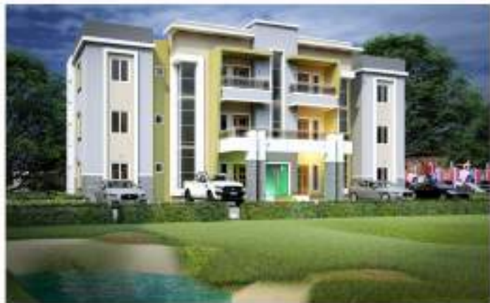
3 Bedroom block of flat 3D View

Sholes City Lifecamp is a luxurious residential complex situated at Plot 1, Cadastral Zone D03 Idogwari, opposite Paradise Phase 2 in FCT Abuja. The complex comprises of 14 units of 2 bedroom block of flat & 17 units 3 Bedroom Block of flat, 4 units of 4 bedroom terrace and 10 units of 5 bedroom stand-alone duplexes.