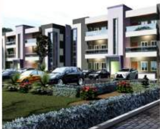
2 Bedroom block of flat 3D View